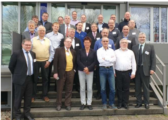
Participants in the second member contact meeting "industry meets science" in Germany

A few applications are mentioned only. There are much more in common use. We are sure that new innovative ideas can be created on the basis of vacuum assisted technologies. That's why the IUVSTA honors environmental protection technologies by the EBARA Award once in every triennium and the DVG by the yearly VACOM Award.