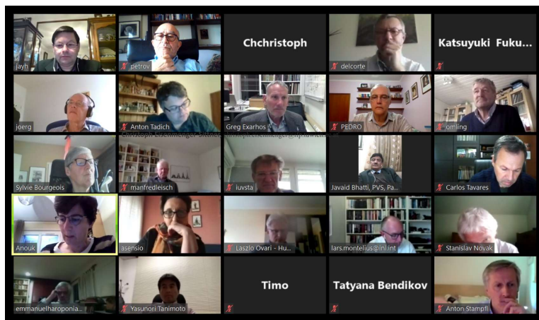
Screengrab from ECM132