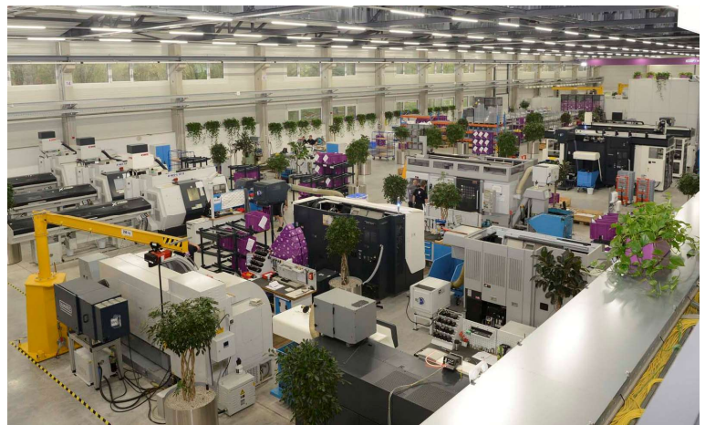
Smart factory – production area of VACOM